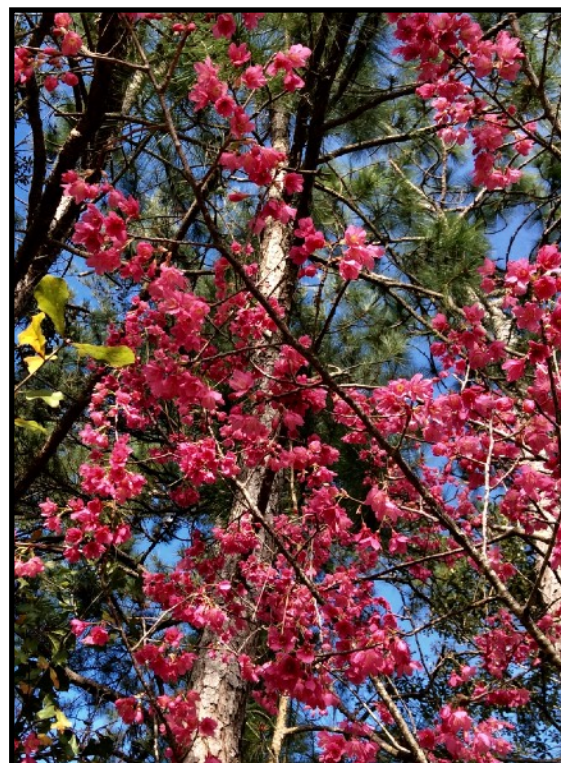
Cherry, non-baring...photo by E Fabian