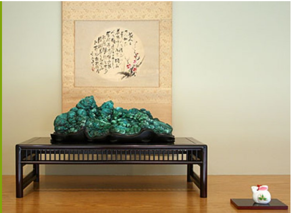
National Bonsai Foundation